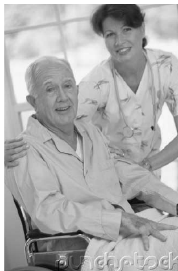
Resistant infections can lead to longer hospital stays.

IDSA does not claim to possess all of the answers, but a combination of the solutions listed in the next section will help. Policymakers should use these recommendations to shape a framework for governmental action.