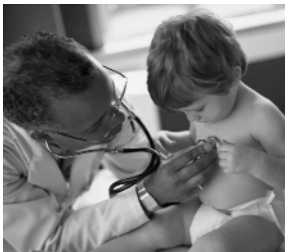
Infectious disease doctors often hold new antibiotics in reserve because of concerns about resistance.

August 2003. A 7-year-old Texas boy came down with a fever of nearly 103 degrees and complained of severe pain in his leg. He was taken to Hermann Children’s Hospital in Houston, where doctors discovered that a virulent, drug-resistant staph infection was causing a potentially fatal blood clot in the boy’s leg. Fortunately, in this case, surgery was life-saving.