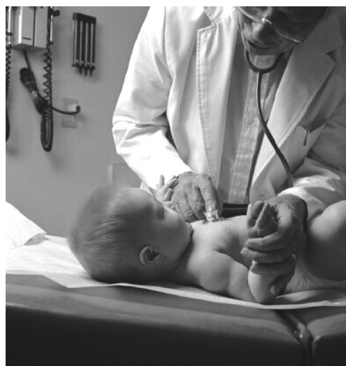
Drug-resistant infections are more difficult to treat.

Federal officials have worked tirelessly over the past few years to help improve U.S. defenses against, and treatments for, bioterrorism agents. Although this work is needed and appropriate, it also is necessary to keep risks in perspective. Drug-resistant bacterial infections kill tens of thousands of Americans every year and a growing number of individuals are succumbing to community-acquired infections. An epidemic may harm millions. Unless Congress and the Administration move with urgency to address these infections now, there is a very good chance that U.S. patients will suffer greatly in the future.