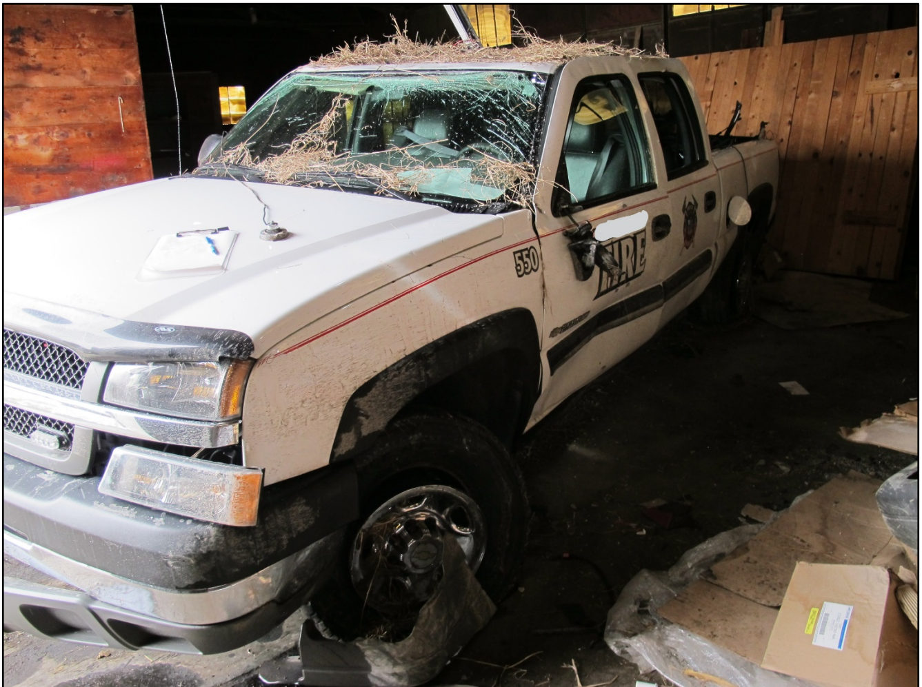
Photo #1. Fire department pickup truck involved in fatal rollover crash.

The vehicle involved in this incident (Medic Truck #2) was a 2004 heavy duty rear wheel drive pickup truck (see Photo #1 ). The truck was purchased new in 2004 under a Federal Emergency Management Agency (FEMA) grant and served as one of the fire department's medic trucks. The fire department ensured regular maintenance of the pickup truck every 3,000 to 5,000 miles by a local auto service garage. Its last maintenance occurred on February 25, 2016 which involved its regular oil change (45,172 miles), chassis lube, tire pressure check, and fluid levels check (brake, power steering, coolant, transmission, and battery). The truck was not equipped with an electronic stabilization control (ESC) system [NHTSA, 2007a].