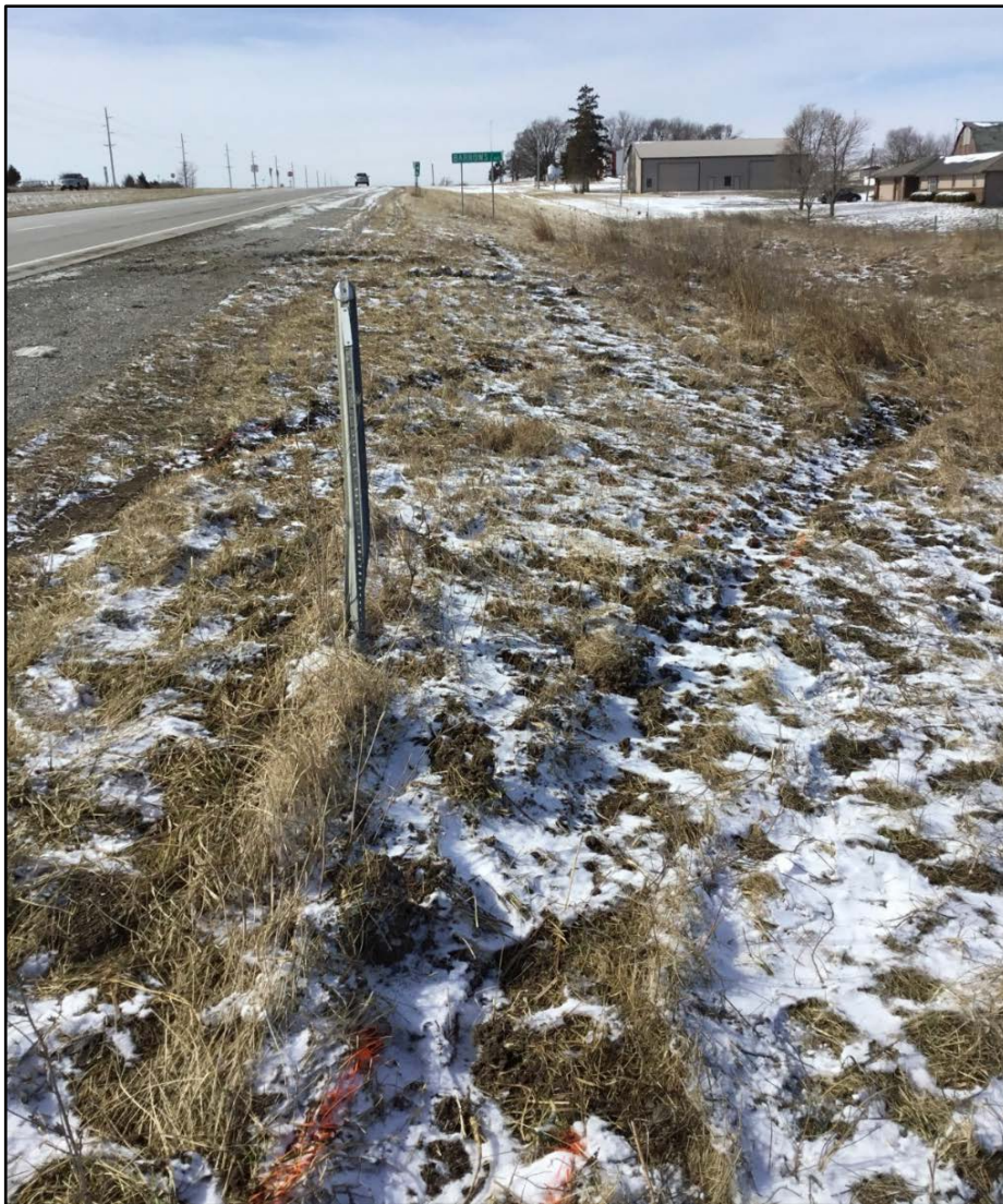
Photo #6. Tire tracks of the pickup truck leaving the highway shoulder into a sloping ditch/field.

At the time of the motor vehicle crash, the pickup truck was traveling on a concrete 4-lane divided highway (two lanes in each direction) with a posted speed limit of 65 mph. The highway had a 2 part-shoulder: 12-18 inches of a paved surface, followed by 8 feet of sloping gravel, giving way to a grassy ditch/field (see Photo #6 ). The highway was dark with light snow falling. The road surface was concrete with a light cover of snow and ice on the roadway. The temperature was 26°F with winds of 21 mph and gusts up to 28 mph [Weather Underground 2017b].