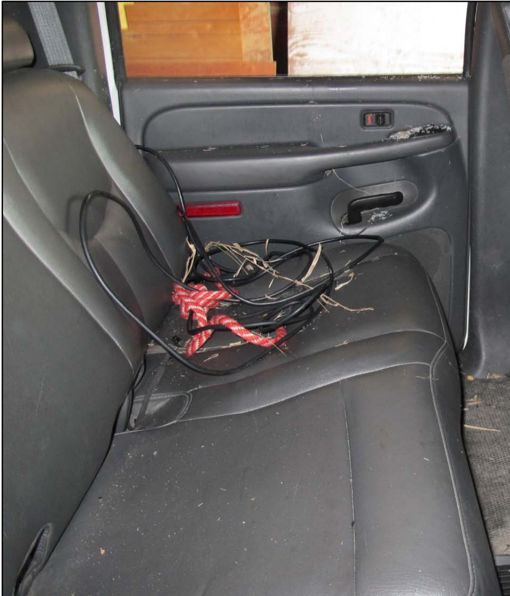
Photo #5. Rear seat driver's side safety belt buckle tucked under the seat.

In addition the rear passenger's driver's side buckle was tucked under the seat (see Photo #5 ). Both photos (#4 and #5) suggest that the rear passenger safety belts were not used at any point during the drive. ( Note: The Event Data Recorder does not monitor use of the rear safety belts.)