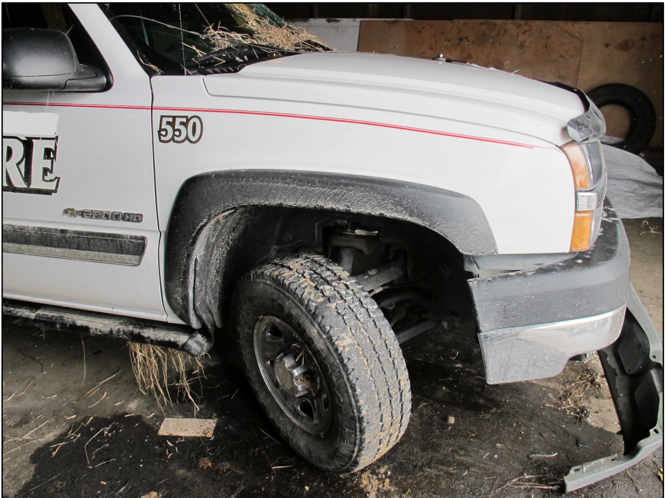
Photo #2. Front passenger side tire showing good tread depth (9/32”).

The Driver of the vehicle did not report any problems with the pickup truck operation during, or prior to, this incident. NIOSH investigators were unable to obtain an odometer reading at the time of this incident, but given its limited use over the past year, it was estimated to be less than 47,000 miles. While inspecting the vehicle at the towing company’s property, NIOSH investigators measured the tread depth of all four tires to be 9/32 of an inch (see Photo #2 ), suggesting the tire tread depth was not a contributing factor in this incident [Heaps 2016].