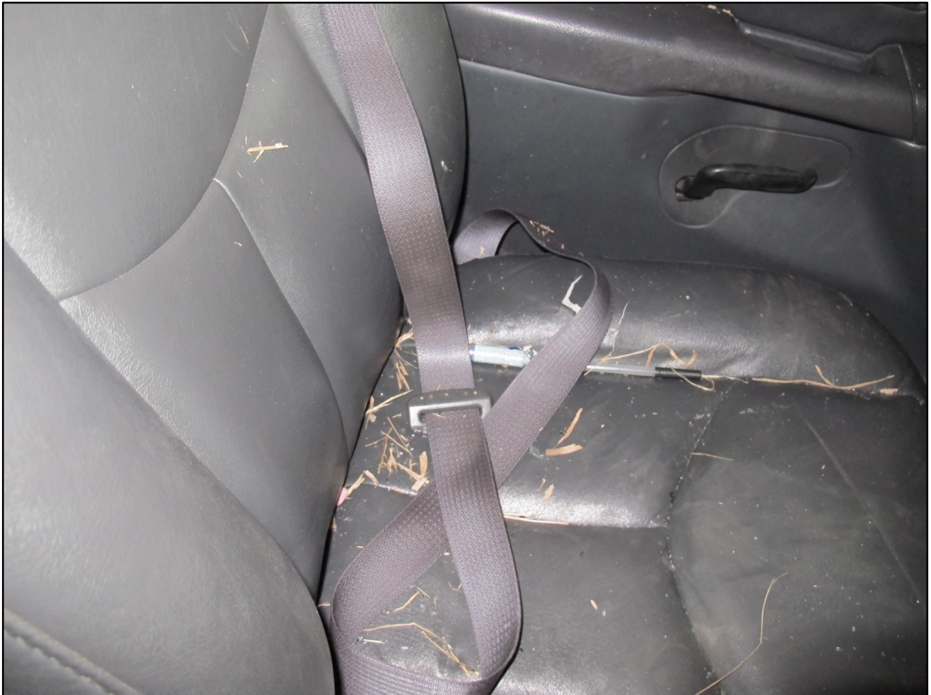
Photo #3. Webbing of the Driver’s safety belt after the Driver exited the vehicle.

The pickup truck had three-point safety belts for the Driver and front and rear seat passengers. A three-point safety belt is a Y shaped belt that is the combination of a lap belt and a sash (shoulder) belt. In a collision the 3-point belt spreads out the energy of the moving body over the chest, pelvis, and shoulders. At the towing company’s garage, NIOSH investigators noted the webbing of the front seat safety belts were extended (see Photo #3 ) strongly suggesting their use during the rollover; a finding confirmed by the “belt switch circuit status” contained in the pickup’s Event Data Recorder (commonly referred to as the vehicle’s “black box”).