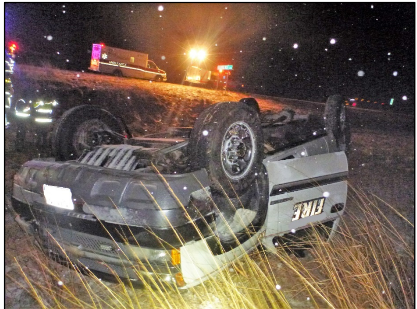
Final position of fire department pickup truck after fatal rollover crash.