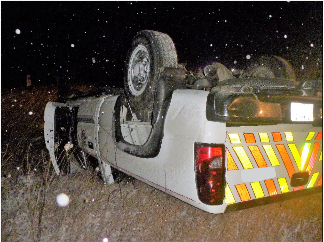
Photo #7. Final position of fire department pickup truck after fatal rollover crash.

The truck rolled 2-3 times before coming to a stop on its roof approximately 100 feet from the where it left the roadway (see Photo #7 ). The front seat airbags did not deploy. During the roll, the driver's side rear seat side window shattered and the fire fighter sitting in the rear seat was ejected from this window. The ejected fire fighter was 21 feet from where the vehicle eventually stopped.