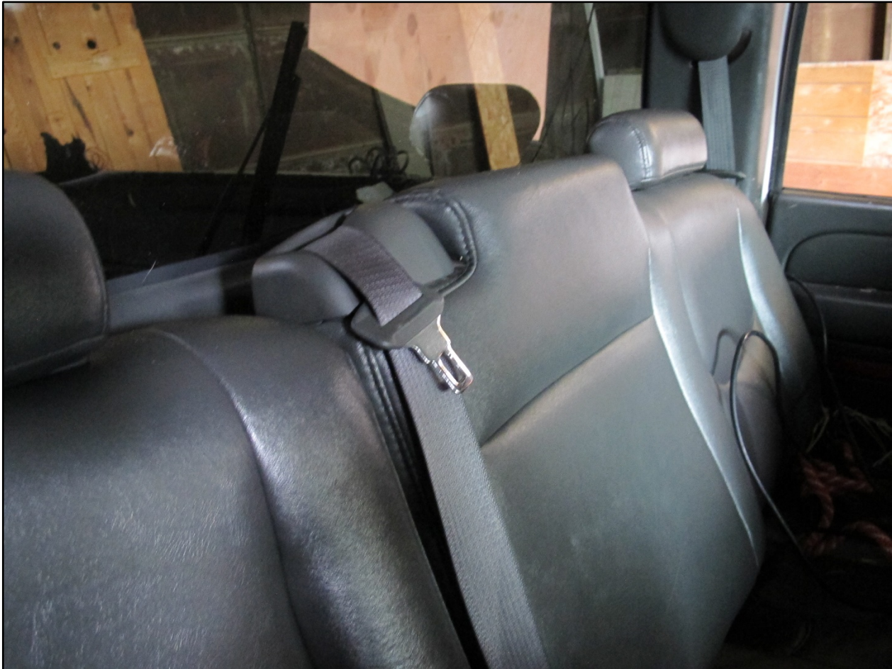
Photo #4. Webbing position of the rear seat driver's side safety belt. Note the webbing's undisturbed position from the pillar loop.

In contrast, the webbing position of the rear passenger driver's side safety belt (see Photo #4 ) was undisturbed from the pillar loop.