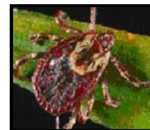
American dog tick Found in Iowa