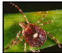
Lone star tick Found in Iowa