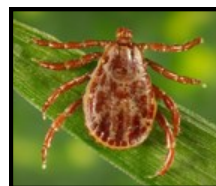
Rocky Mountain Wood Tick Not in Iowa