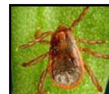
Brown dog tick Not commonly found in Iowa