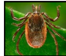
Western Black-legged tick Not in Iowa