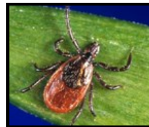
Black-legged/deer tick Found in Iowa