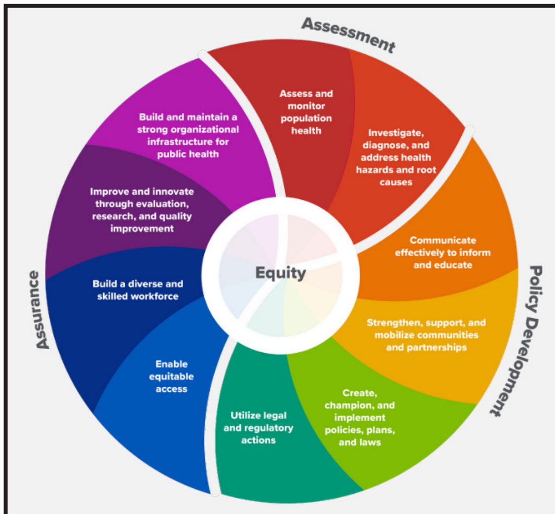
Figure 1: The Ten Essential Public Health Services

Prior to aligning with the Iowa Department of Human Services in July 2022, the Iowa Department of Public Health (IDPH) received national accreditation from PHAB in November 2018. Operating under PHAB standards, IDPH has made significant strides towards improving the quality, accountability and performance of services - including the SHA and SHIP processes. Reaccreditation occurs every five years to ensure continuous improvement.