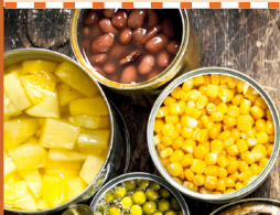
Canned Fruit or Vegetable