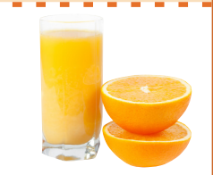
100% Fruit Juice