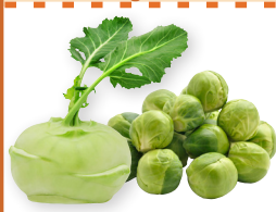
Kohlrabi or Brussel Sprouts